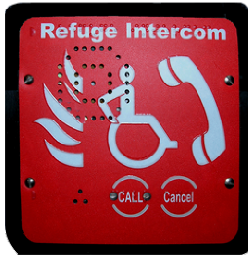
EmerCall Type B Outstation

The EmerCall Emergency Voice Communication System is a fixed, secure, bi-directional, full duplex voice communication system to assist fire fighters in an emergency in high rise buildings or large sites where radio communication may not work, and covers the operation of both fire telephones and disabled refuge systems. Where both systems are fitted to a building BS5839 Part 9:2003 specifies these should form a single system.