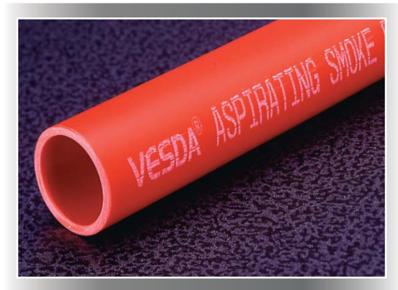
Both VSC and ASPIRE2 are compatible with all detectors in the VESDA product line.

Some pipes and fittings are not available in certain countries. Please check with an Xtralis office before you order.